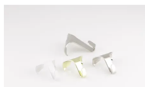
Metal Picture Molding Hangers