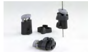
Plastic Gripper Hooks