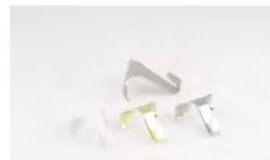
Metal Picture Molding Hangers